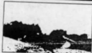
Above: One of few photos — taken in the Italian Alps — of a UFO on the ground.